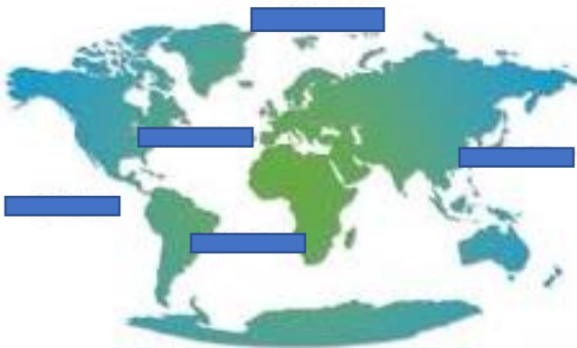
5 Oceans Map

The Earth is made up of 7 Continents and 5 Oceans