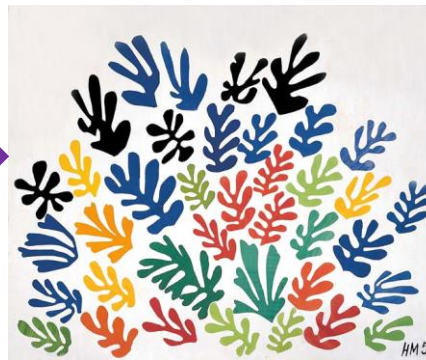
The Sheaf' by Matisse (1953)