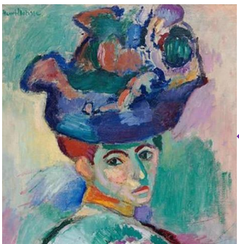
'Woman with a Hat' by Matisse (1905)