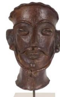
'L'Homme aux Favoris' (The favourite man) (1940)