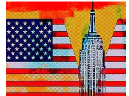
Jasper Johns (born 1930) American painter and printmaker