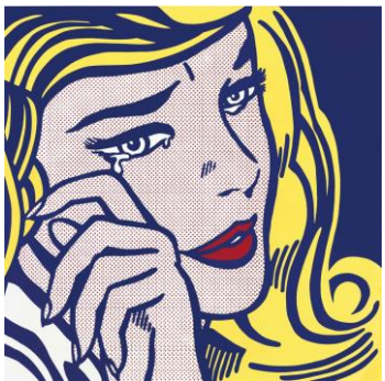
Roy Lichtenstein (1923-97) American painter