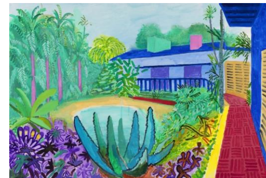
David Hockney (born 1937) British painter and photographer