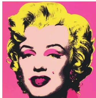
Andy Warhol (1928-87) American artist