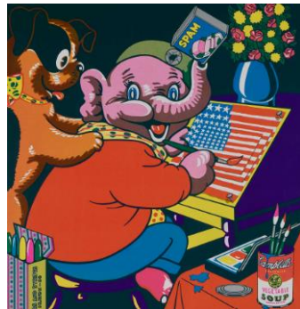
Eduardo Paolozzi (1924-2005) British sculptor and painter